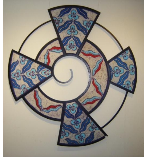
3a: Loop. 2012. 140x140 cm