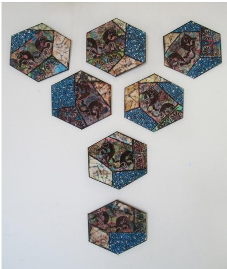
Image 2. Honeycomb Series. 2013. 100x170

In a similar work (image 2), he mounted batik fabrics on seven pieced Dakota cut in hexagonal honeycomb form and preferred in the patterns commonly used motives of Turkish hand-painted kerchiefs. He dyed remaining loyal to colors specific to Seljuk culture; tried to create a water color effect with brush and block printing in figures. Similar effects with the same color and composition are seen in image 2a, his another work prepared with metallic and wooden frameworks.