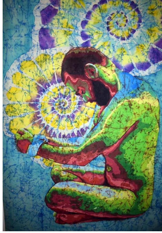
4a: I AM Series.No2. 107x220cm

Considering the batik samples in the exhibition, he technically used waxed batik and brush as in his first works. He used softer colors to lighten the nudeness of the figure and he did not want it to be perceived as sexuality. After having dyed the figures with brush, he used waxed batik technique on the whole surface of the fabric to create the textural effect he wanted. He preferred hot colors where the light reflected and cold colors in other places. The posture of the figure explains the loneliness of the person with hope rather than the hopelessness in the sense that we know (Image 5-5a). According to Yörük, figure is not so much important here; what is important is the message wished to be given. While there are Ammonoidea pattern on the ground and neon colors in the figure of his work seen in the Image 4a, optical illusions attract attention on the ground of Image 4 and 5a, and chiaras curosin the colors come to his forefront.