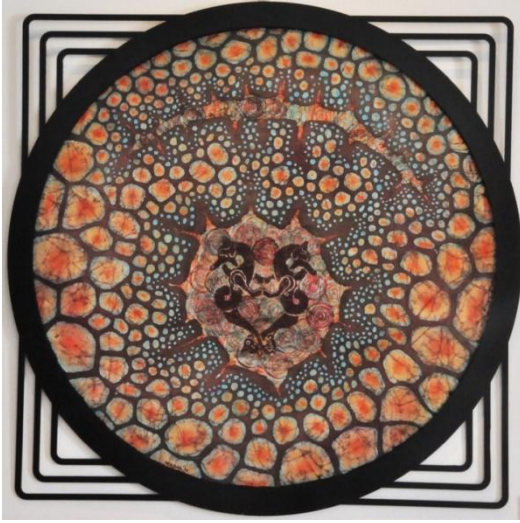
Image 3. Dragon. 2013. 120x120cm