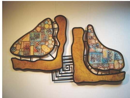
2a: Stones. 2012. 90x150cm

In his work dated 2014, he placed commonly-encountered Seljuk dragon symbol on the center of a big circular form put on square metallic forms, and abstract textural effects resembling to starfish are seen around it (image 3). He gives this textural effect mostly with orange shades, brown shades on the ground and within them turquoise color match. In his another work seen in image 3a, Çintemani and Tiger Stripe motives, used on kaftans of sultans in the 16 th century Ottoman Empire and in tile of mosques, were applied on the fabric without being deformed and were mounted on spiral formed metallic frameworks for decorative purposes.