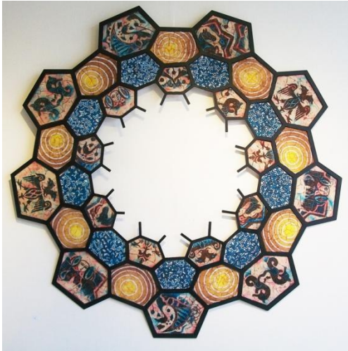
Image 1. Honeycomb Series .2014. 150x150cm