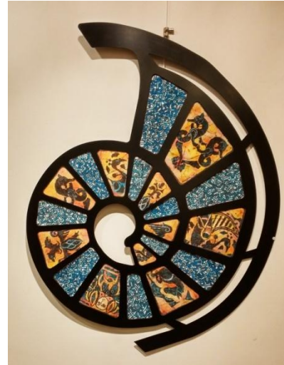
1-a: Ammonite Series 2015. 90x130cm